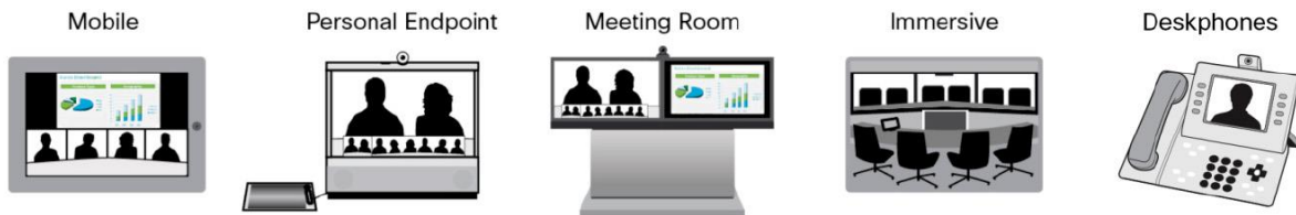
Figure 1. Examples of Supported Modes

A critical requirement for all customers is ensuring a high return on investment (ROI). Cisco TelePresence Server has a software upgrade path that enables customers to deploy new features as required, and with the cost-effective licensing model they can closely manage their investment while reaping the rewards of enhanced business agility, faster decision making, lower travel expenses, and increased employee productivity.